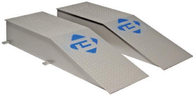
STEEL WHEEL RISERS (SWR)