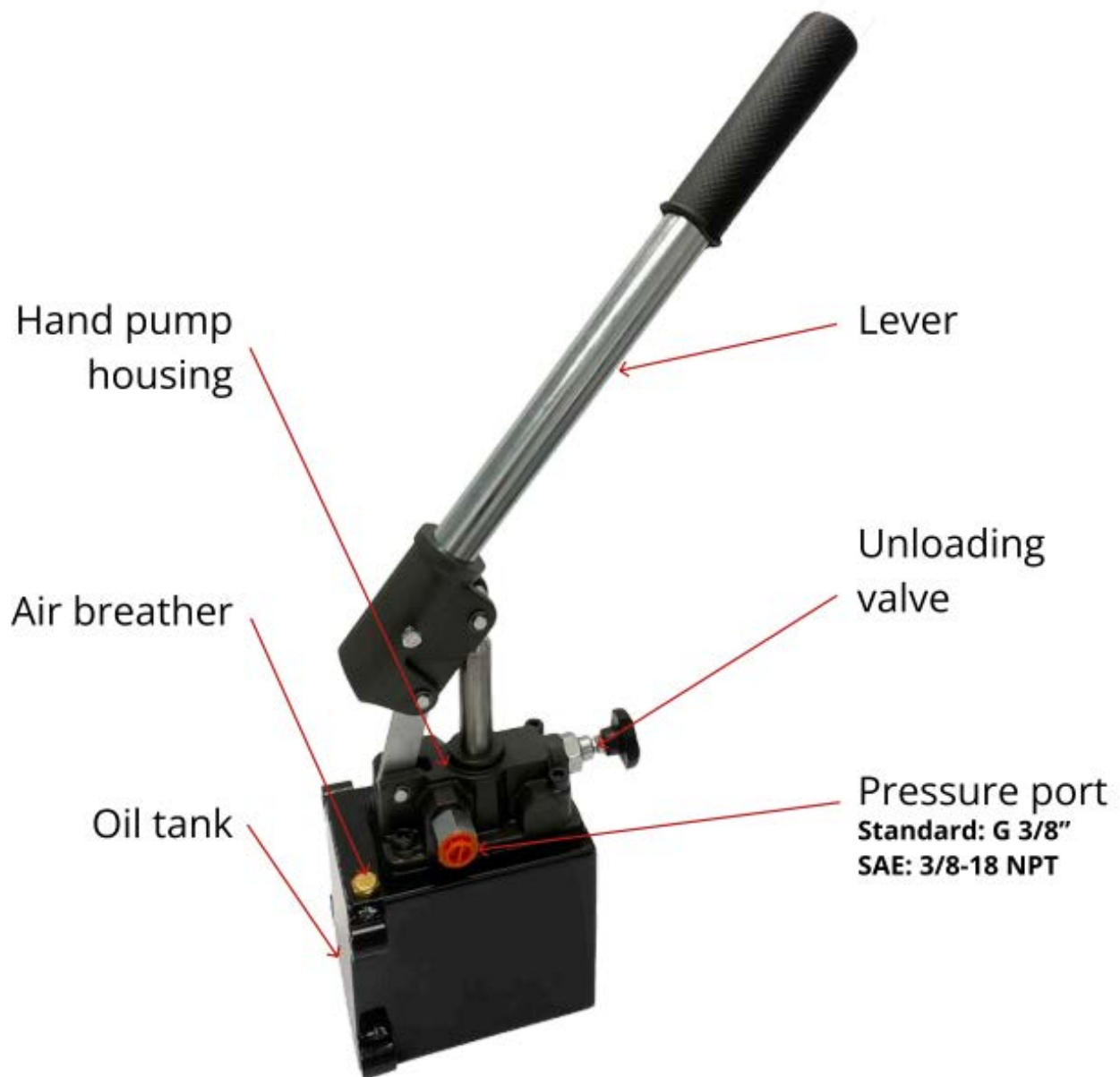
Photo 1. Main components of a single acting hand pump

TO PROTECT YOUR WARRANTY, USE ONLY MAGISTER HYDRAULIC OIL.